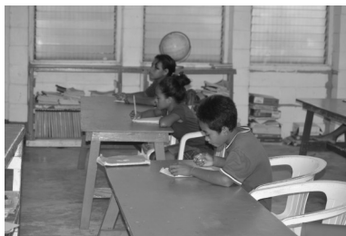
Nukuoro Elementary School

ing classrooms and the IEP students. After school I provide tutoring in Math and English for the special needs students. I also take care of the school's library, which has 30-some students.