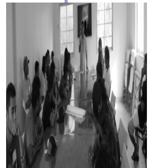
WD&ST Students Meeting, Feb 13th

potential will continue for another three months and then acquire certification in their field of study. The Department's staff will assist trainees in finding employment during their last month of training.